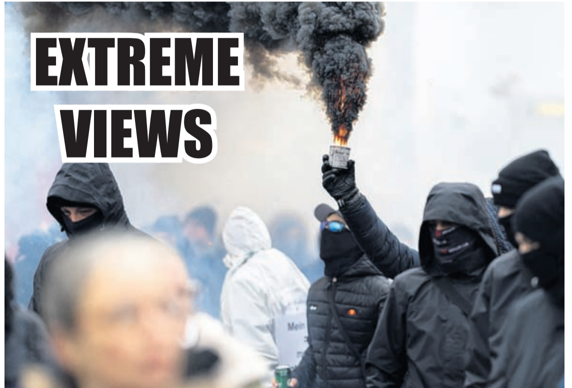
Protestors light flares during a demonstration against measures to battle the coronavirus pandemic in Vienna, Austria, on Dec. 11, 2021.